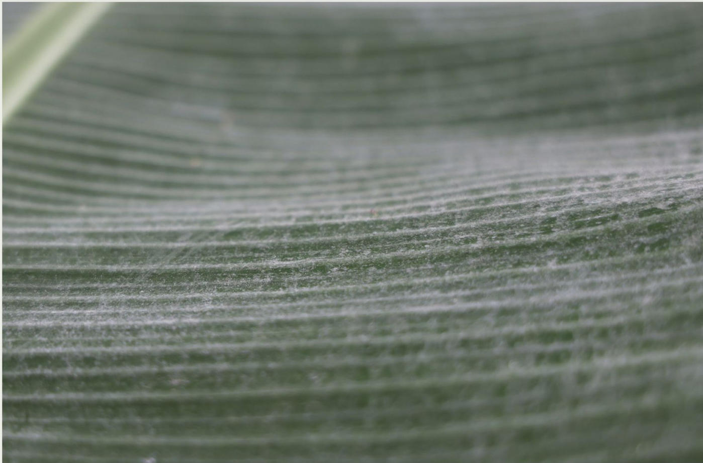
White dust on banana leaves near the Republic Cement factory in Norzagaray, Bulacan.