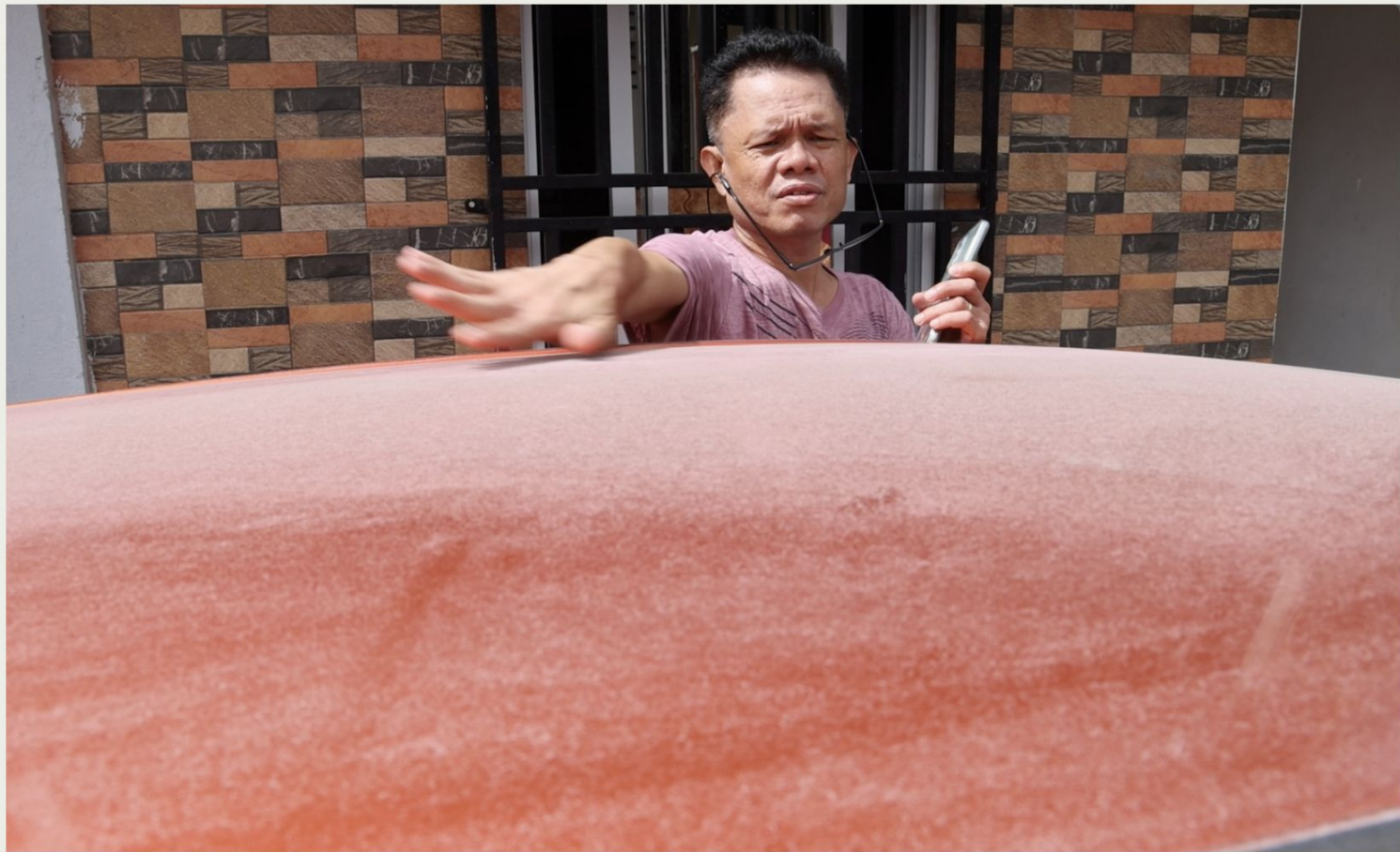
Dust, apparently from a nearby cement factory, on residents' cars in Bigte, north of Manila.