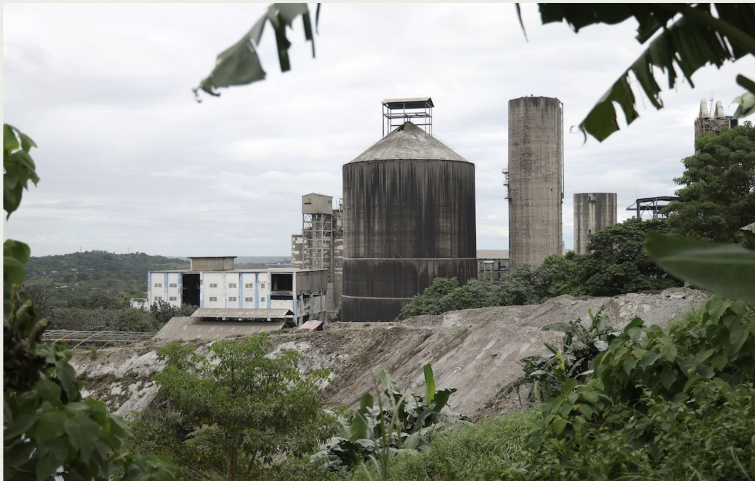
A Republic Cement factory in Norzagaray, Bulacan.